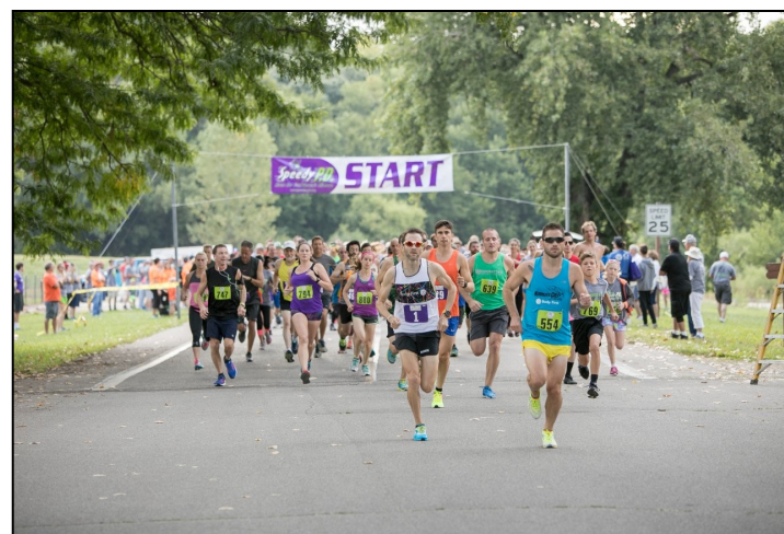
2017 Speedy Pd Race participants take off at the starting line.

The purpose of the race is to raise funds to support the Meadowlark Parkinson's Program in its years-long tradition of providing free exercise classes, educational opportunities, community outreach and scholarship to those in the Flint Hills affected by PD. Additionally, the race is an opportunity to raise awareness and understanding of Parkinson's Disease (PD); to honor those affected by PD; to exercise (run &/or walk a 5k, 10k or ½ Mile); and to enjoy the