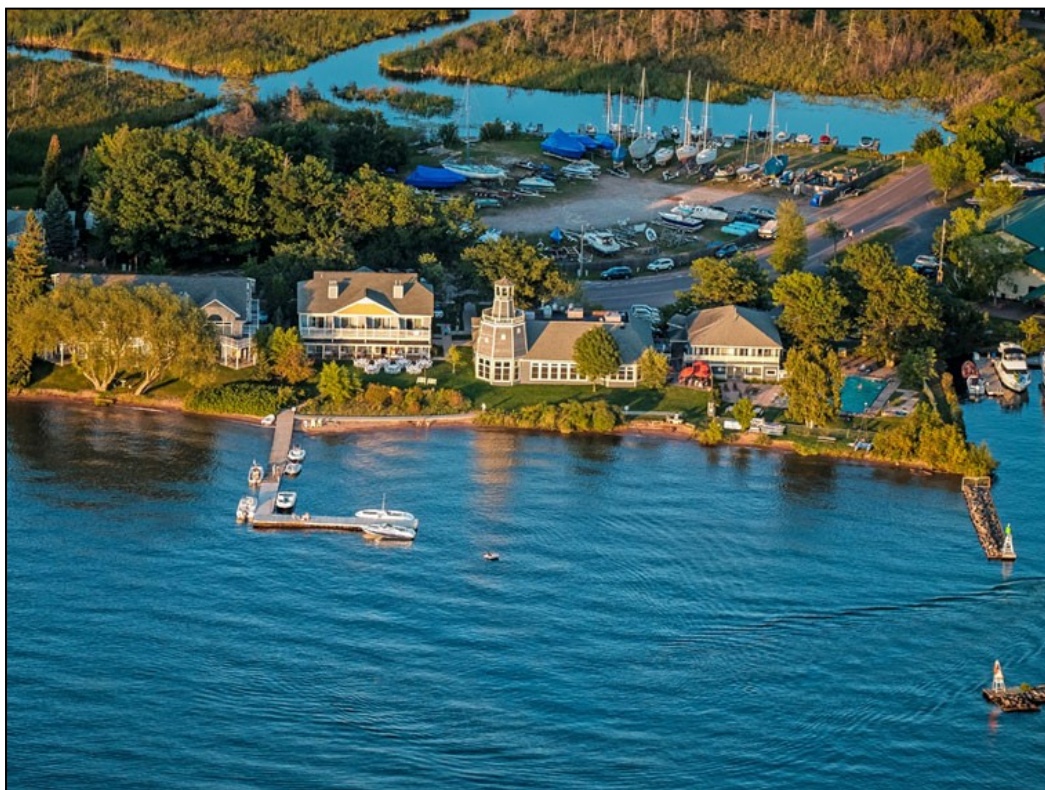
[above] Travelers will enjoy lunch, a guided tour and free time on Madeline Island, the largest of Lake Superior's Apostle Islands.