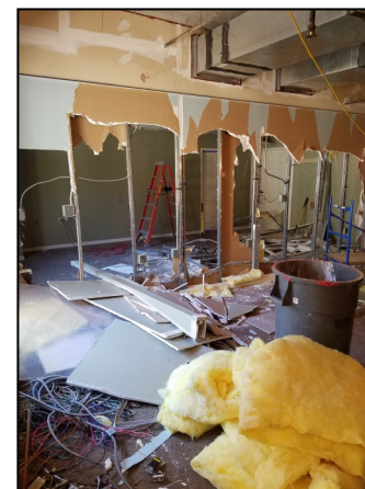
[above] Demolition continues in Verna Belle's Café. This work is the source of the recent construction noise in the main building at Meadowlark.