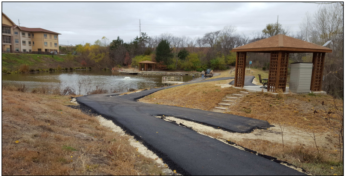
The 6-foot-wide asphalt trail at Bayer Pond Nature Area provides access to two fishing docks and two gazebos as well benches at Leon's Birding Glen (not pictured).

While Jones's gift is substantial, it wasn't enough to cover the entire $35,000 price tag of the trail project. The contractor, Doug Newland, proposed a trail 6 feet