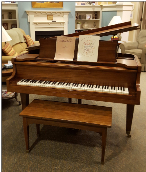
This 1928 Gulbransen piano is now part of the furnishings at Bramlage House.